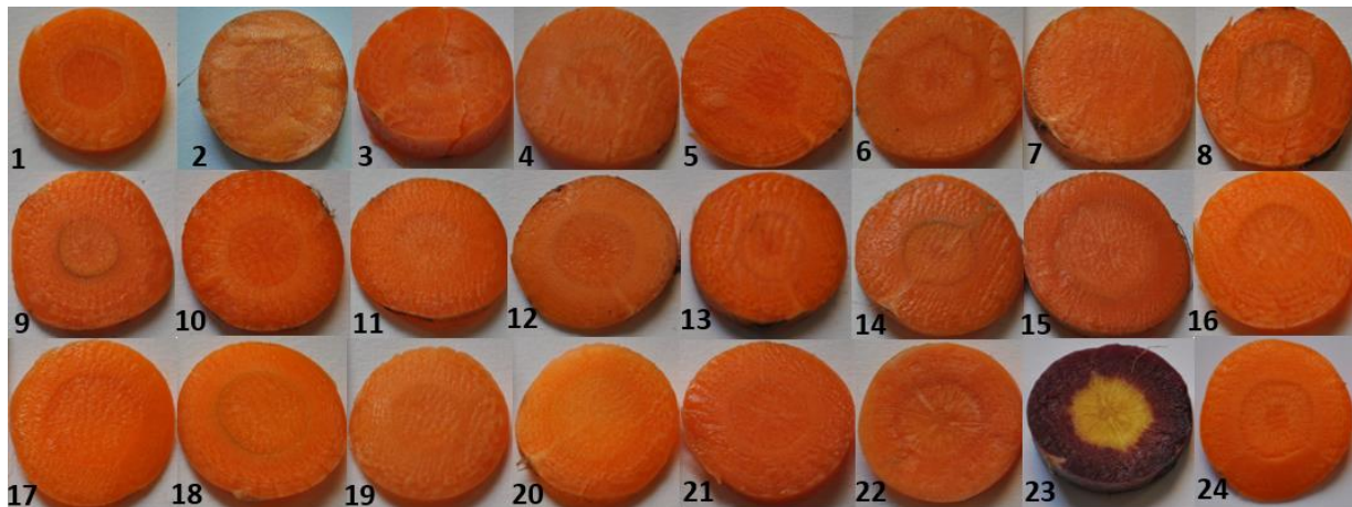
Figure 2 Flesh colour distribution in transverse section of 24 tested carrot root varieties.

The results show that there was a wide range of variability in almost all traits, except for no occurrence of branching and top greening.