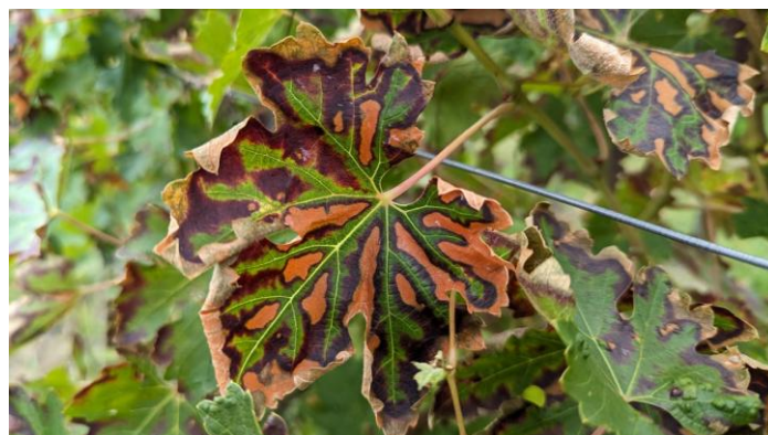
Figure 1 Chronic form of Grapevine trunk diseases on the red wine variety Cabernet Sauvignon..

The aim of the present study was to compare the quantitative parameters of grapes and the qualitative parameters of grape must and wine from symptomatic and asymptomatic grapevines of the Cabernet Sauvignon and Riesling Italico wine grape varieties in the climatic conditions of Slovakia.