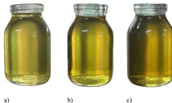
Figure 1 Sesame oils from different varieties (a: WSO, b: YSO, c: BSO)

Regarding viscosity, WSO and YSO had similar values (about 39 cP), while BSO had a significantly higher viscosity (44.60 cP). When compared with other studies, the viscosities of WSO and YSO were similar to those of sesame oil from Akure, Ondo State, Nigeria (39.1 cP) (Ollannsuununkami et al. , 2017), but higher than those of sesame oil from Kogi State, Nigeria (35.80 cP) (Betiku et al. , 2012). This difference may be due to the different chemical compositions between the oils, especially the content and ratio of fatty acids, as well as other compounds that may influence molecular interactions. The specific gravity of the oil samples in this study ranged from 0.875 to 0.889, with WSO (0.877), YSO (0.889), and BSO (0.875). Comparison with other studies shows that the specific gravity of sesame oil in this study was somewhat lower than that of sesame oil from Akure, Ondo State, Nigeria (0.91) and comparable to that of sesame oil from Kogi State, Nigeria (0.88) (Ollannsuununkami et al. , 2017; Betiku et al. , 2012). The differences in viscosity and specific gravity may be due to many factors, including sesame variety, growing conditions, extraction method, and other environmental factors.