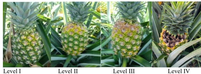
Figure 1. The criteria are the severity levels of sunburn on MD2 Pineapple. Damage Level: Level 1 - 1/3 of the fruit; Level 2 - 2/3 of the fruit; Level 3 - entire length of the fruit with sunburn; and Level 4 - scalding.

The evaluation of sunburn in MD2 cultivar is carried out according to the criteria by Santos et al. (2020), where damages are classified into four levels (Figure 1), according to the intensity of a color change and the affected fruit surface area. Level 0 is for fruit with no sunburn symptoms, which is the normal green peel color. Level I has a slightly yellow color that is limited to one area only. Level II is characterized by yellowing that is spreading, accompanied by some browning, with one side of the fruit exhibiting a more intense coloration. In contrast, Level III presents extensive yellow-brown discoloration covering more than half of the fruit, with increased damage to the epidermal tissue. Level IV is described as the most severe condition, which consists of necrotic areas that are dark brown to black and structural damage, such as cortex cracking, causing the fruit to be unfit for fresh-market quality. The use of this type of classification enables uniform determination of sunburn severity and shows the difference between commercially tolerable and serious damage.