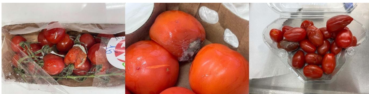
Figure 1 Mouldy tomatoes samples

Legend: S – samples from retail chains in Slovakia, H – samples from retail chains in Hungary