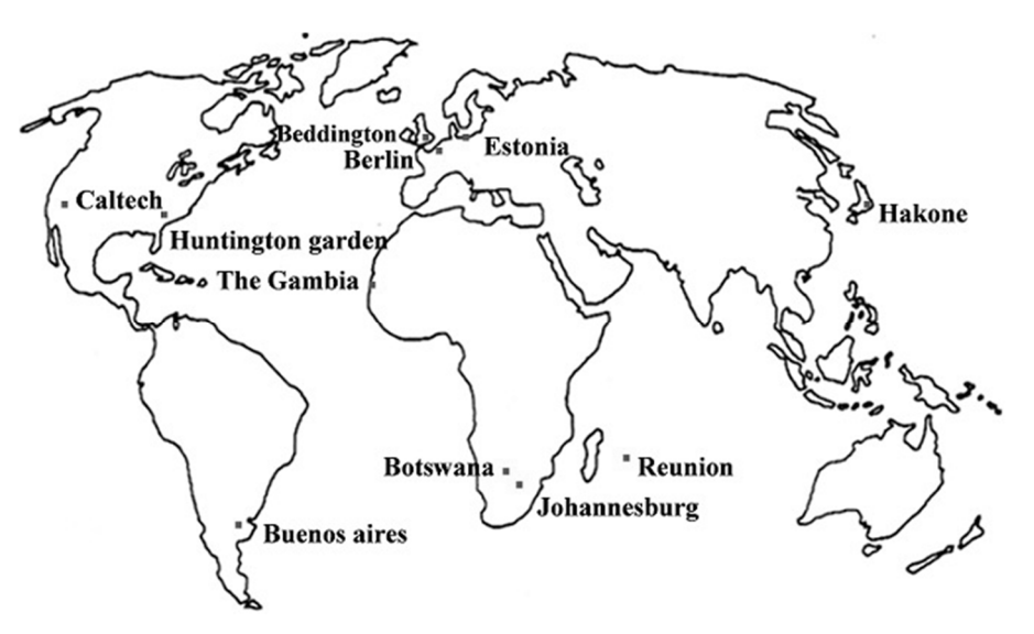
Figure 1 Illustration of regions where soil samples were collected