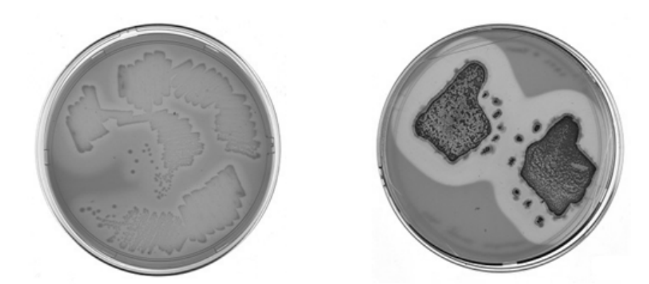
Figure 2 Purified strains streaked onto latex agar plates, isolates (right) Chiba and (left) HZ

Twenty five strains displaying clear zone formation on latex agar plates were purified. All isolates were broadly characterized on the basis of rubber degradation. Below are images of two potent extracellular rubber degraders (Fig 2).