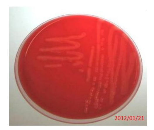
Figure 2 β-haemolysis production by A. hydrophila on tryptone soy agar with 5% sheep blood

The majority (30 of 36) of isolates 83.33% of the A. hydrophila produced \beta -haemolysis on tryptone soy agar with 5% sheep blood. The \beta -hemolysis pattern results in the media displaying clear halos around bacterial colonies (Fig. 2) The haemolysins produced by A. hydrophila are divided into two major groups, such as extracellular haemolysin and aerolysin based on immunological studies (Kozaki et al. , 1989).